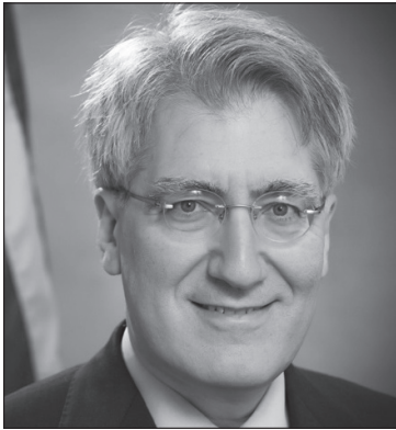
Dr. Robert P. George